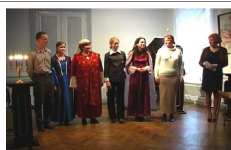
The young musicians of Hiiumaa

The concert set the tone for a fine dinner followed by dance and fireworks—set of by a fine view looking out over the Baltic Sea from the shores near Kärda.