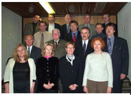
Members of the B7 on Hiiumaa.

Unfortunately we forgot to inform the weather, that organised the flight from Gotland to be cancelled and the Tallinn-Kärda flight delayed, plus it was raining so we had to take the photograph inside!