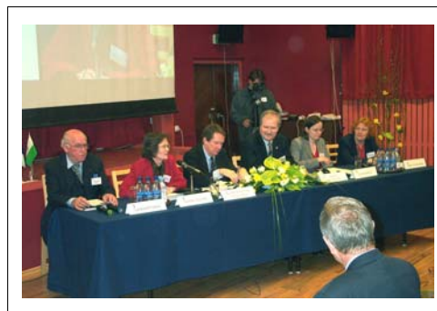
Panel at the Enlargement Conference.

Recently a site map has been added which certainly makes it easier to get around. The website. And Saaremaa has upgraded its island page.