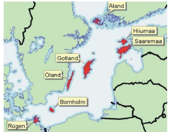
Islands of the B7

If you know of dates that should be added to this calendar please let me know at ffdh@bora.dk