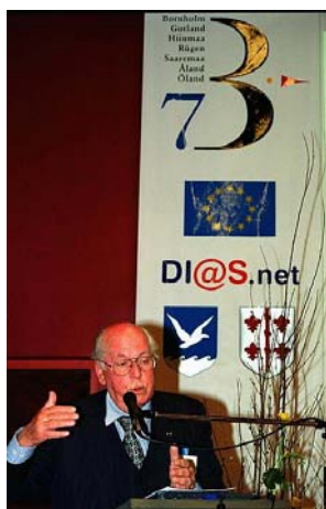
Former President, Lennart Meri