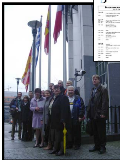
B7 in Brussels

Board Meeting and meetings with Helcom and the Bonus project.