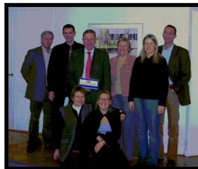
B7 in Helsinki

There were discussions on BEIs "Europes Strategy for the Baltic Sea Region", the Maritime Policy (and the up-coming greenbook), the thematic Marine environment as well as lobbying and how to influence the different parts of the European Union.